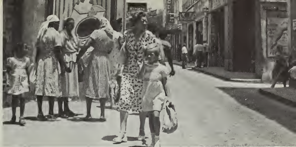
Above right, tourists shop on a narrow street in Curaçao and, right, help themselves to a buffet supper at a resort hotel in Montego Bay, Jamaica.